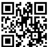
LNE Home Page

Home Page: https://lne.lps.org/ Athletics: https://lincolnnortheasths.rschoolteams.com/